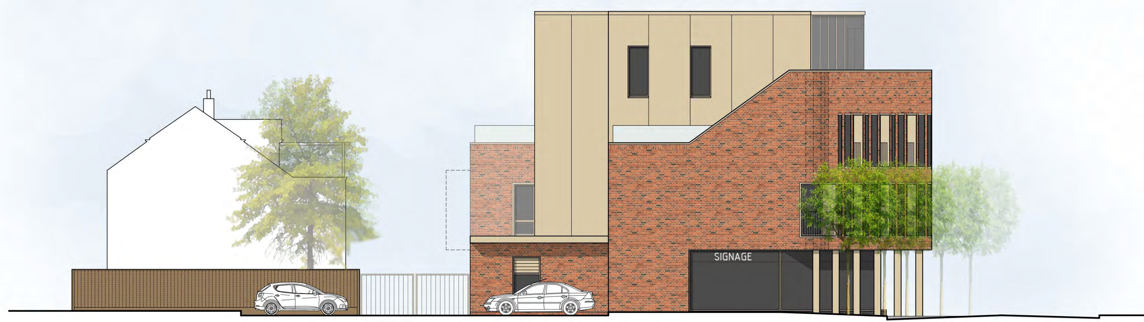
AS PROPOSED: ELEVATION BB.