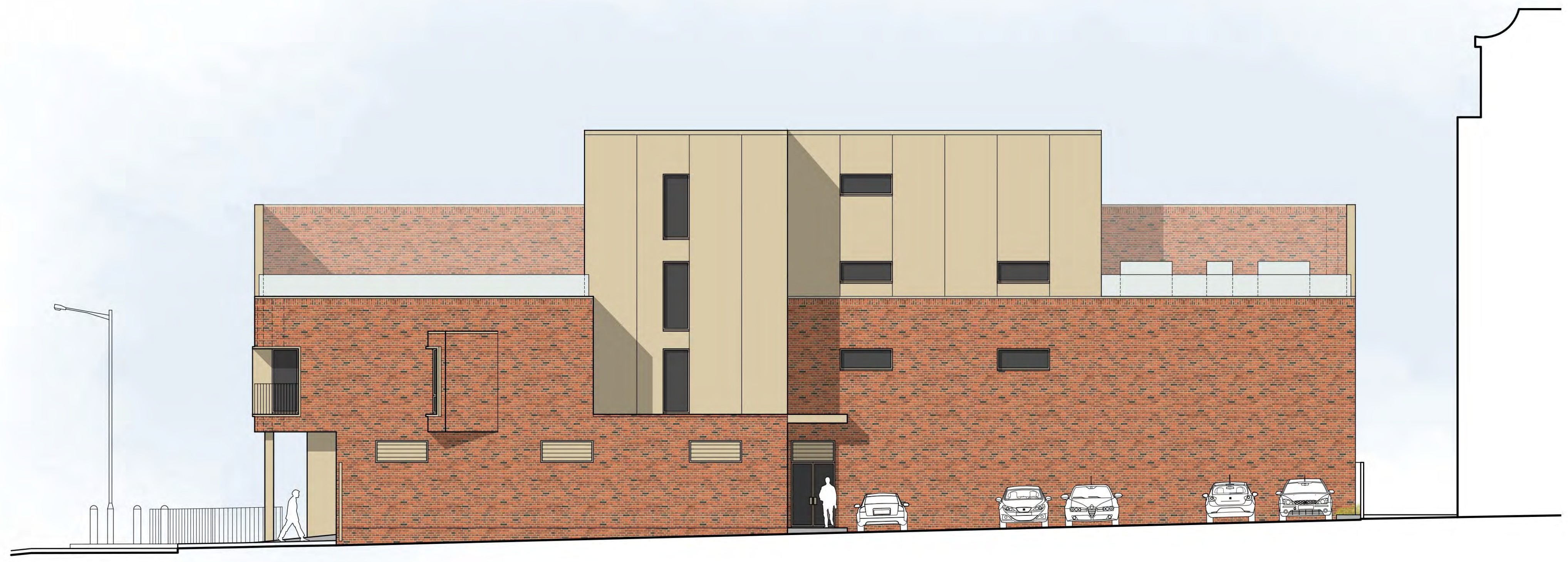
AS PROPOSED: ELEVATION AA.

GENERAL NOTES The copyright in all designs, drawings, schedules, specifications and any other documentation prepared by DAP Architecture Ltd. in relation to this project shall remain the property of DAP Architecture Ltd. and must not be reissued, loaned or copied without prior written consent. Do not scale from this drawing, use figured dimensions only. Prefer larger scale drawings. All dimensions are in millimeters (mm) unless otherwise noted. Check all relevant dimensions, lines and levels on site before proceeding with the work. This drawing is to be read in conjunction with all Architect's drawings, schedules and specifications, and all relevant consultants and/or specialists' information relating to the project. Refer all discrepancies to DAP Architecture Ltd.